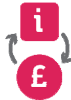
3: Intelligence Hub